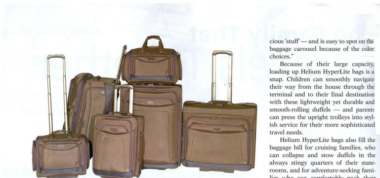
The Travelpro Crew7 Collection includes Expandable Rollboard® Suiters in 22", 24", 26" and 28" sizes, among other pieces. Colors: black, dusty rose, chestnut. MSRP: $460-$620.