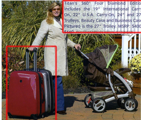
Titan's 360° Four Diamond Edition includes the 19" International Carry-On, 22" U.S.A. Carry-On, 24" and 27" Trolleys, Beauty Case and Business Case. Pictured is the 27" trolley. MSRP: $400-$660.